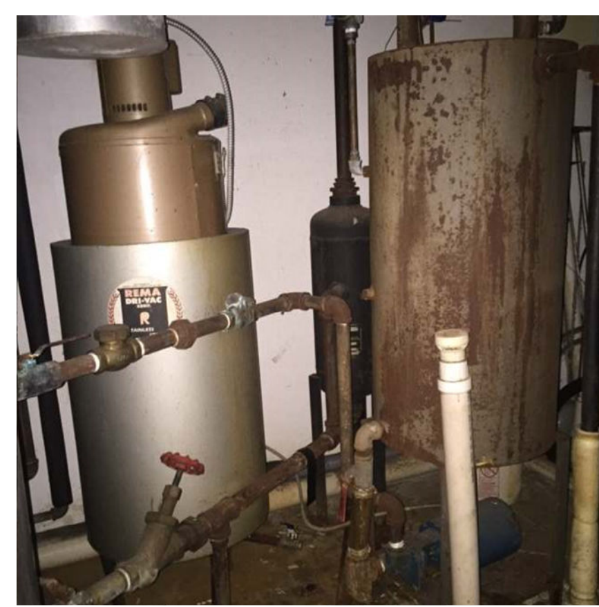
UTILITY ROOM PHOTOS