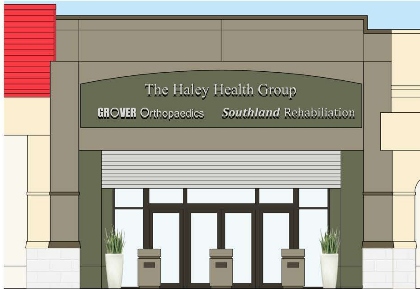
1 MAIN ENTRANCE SIGN OPTION 1 SCALE: 1/4" = 1'-0"

FILENAME: I:\NL - PROJECTS\CONVENT\B0401000 - Island Walk - 0111_0501_00\DRAWINGS\DWG\Sign - Unit 22C.dwg PLOTTER: HP DesignJet 5000PS PLOT DATE: 05/04/2010 10:47:47 AM PLOT TIME: 05/04/2010 10:47:47 AM PLOTTER: HP DesignJet 5000PS PLOT DATE: 05/04/2010 10:47:47 AM PLOT TIME: 05/04/2010 10:47:47 AM PLOTTER: HP DesignJet 5000PS PLOT DATE: 05/04/2010 10:47:47 AM PLOT TIME: 05/04/2010 10:47:47 AM