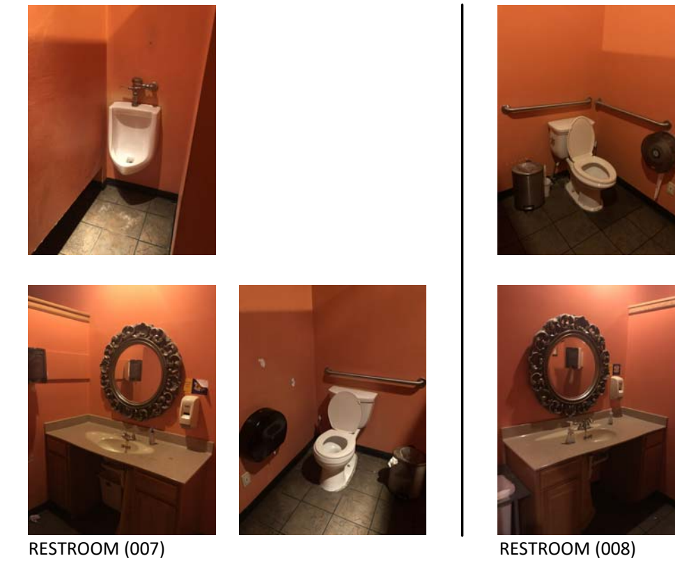
1 RESTROOM COMPLIANCE (PHOTOS) NOT TO SCALE

LEGEND 5/8" H=4'-0" = SILL/HEAD HEIGHT 6" = DOOR WIDTH/TYPE SPOT ELEVATION FE = FIRE EXTINGUISHER STUB FOR PLUMBING FA = FIRE ALARM (PULL STATION) FS = FIRE STROBE CF = CEILING FAN RD = ROOF DRAIN (INTERNAL)