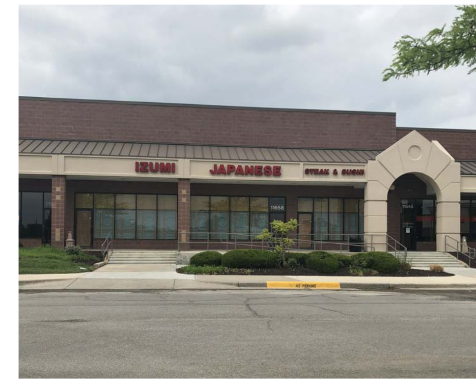
2 ELEVATION (PHOTO) NOT TO SCALE