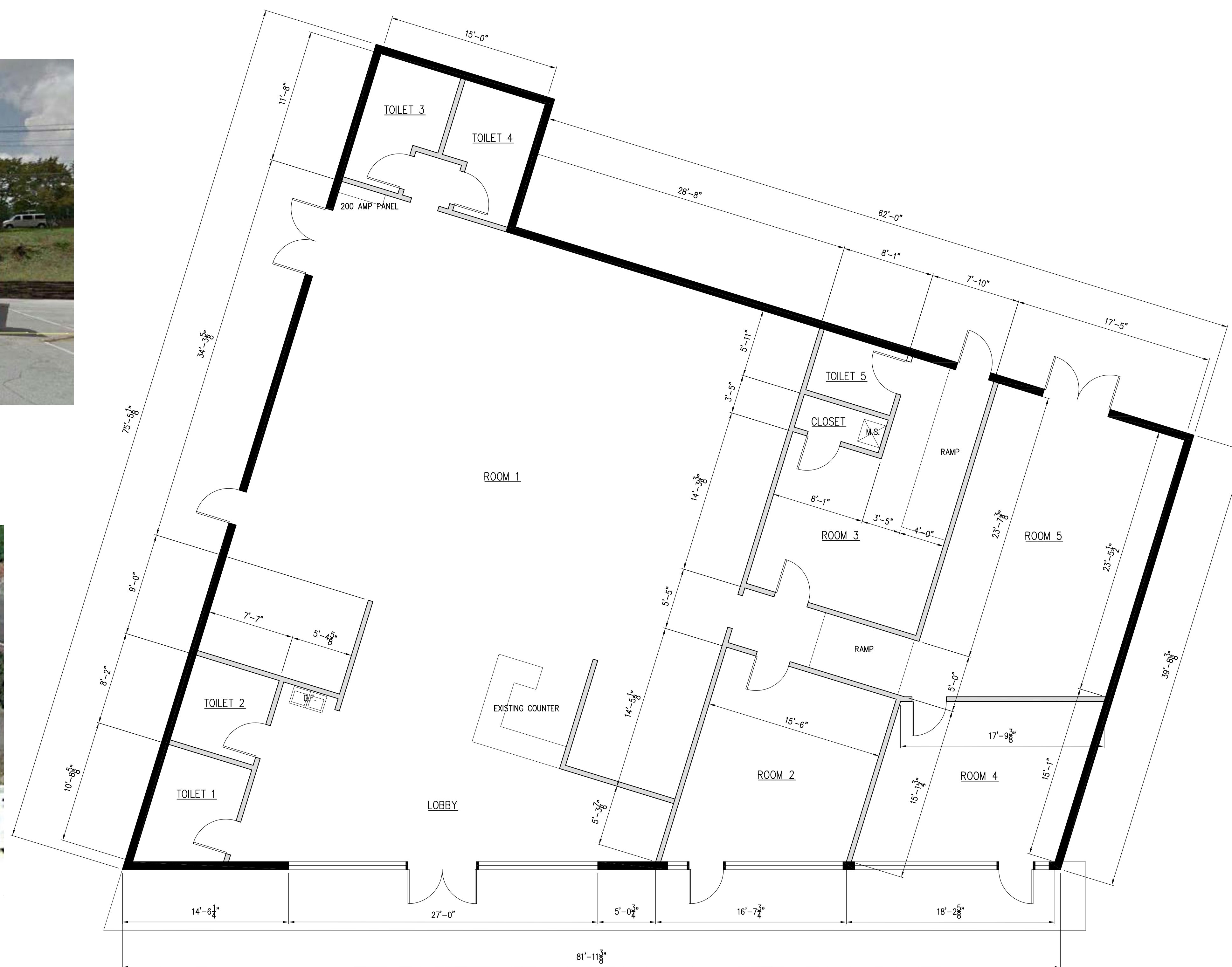
1 FLOOR PLAN A-1.0 SCALE: 3/16"=1'-0"