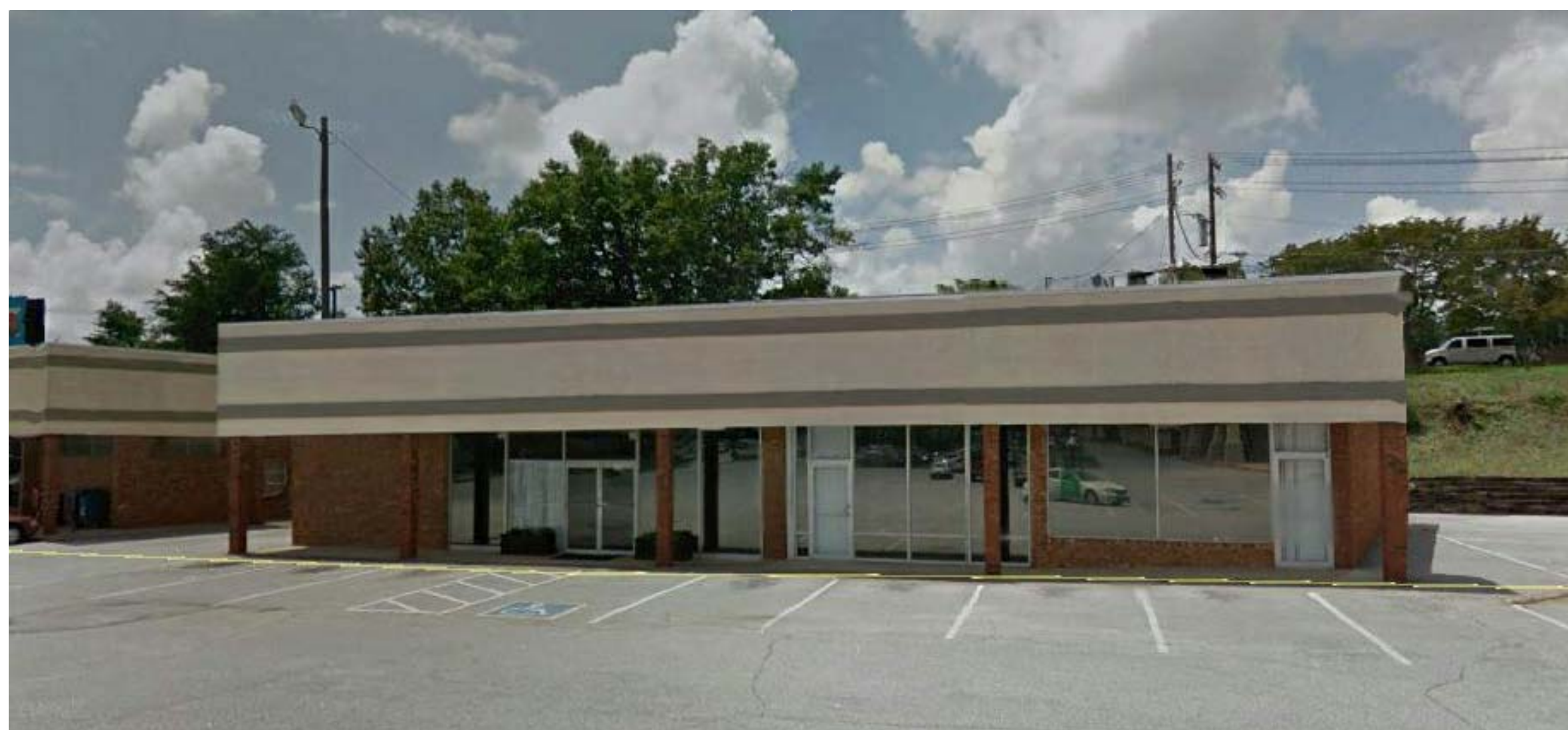
1 FRONT ELEVATION A-1.0 SCALE: N.T.S.