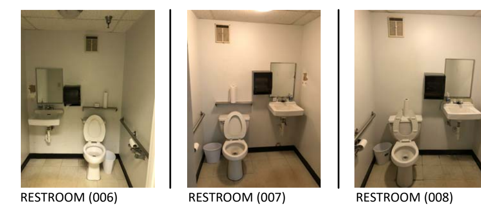
1 RESTROOM COMPLIANCE (PHOTOS) NOT TO SCALE