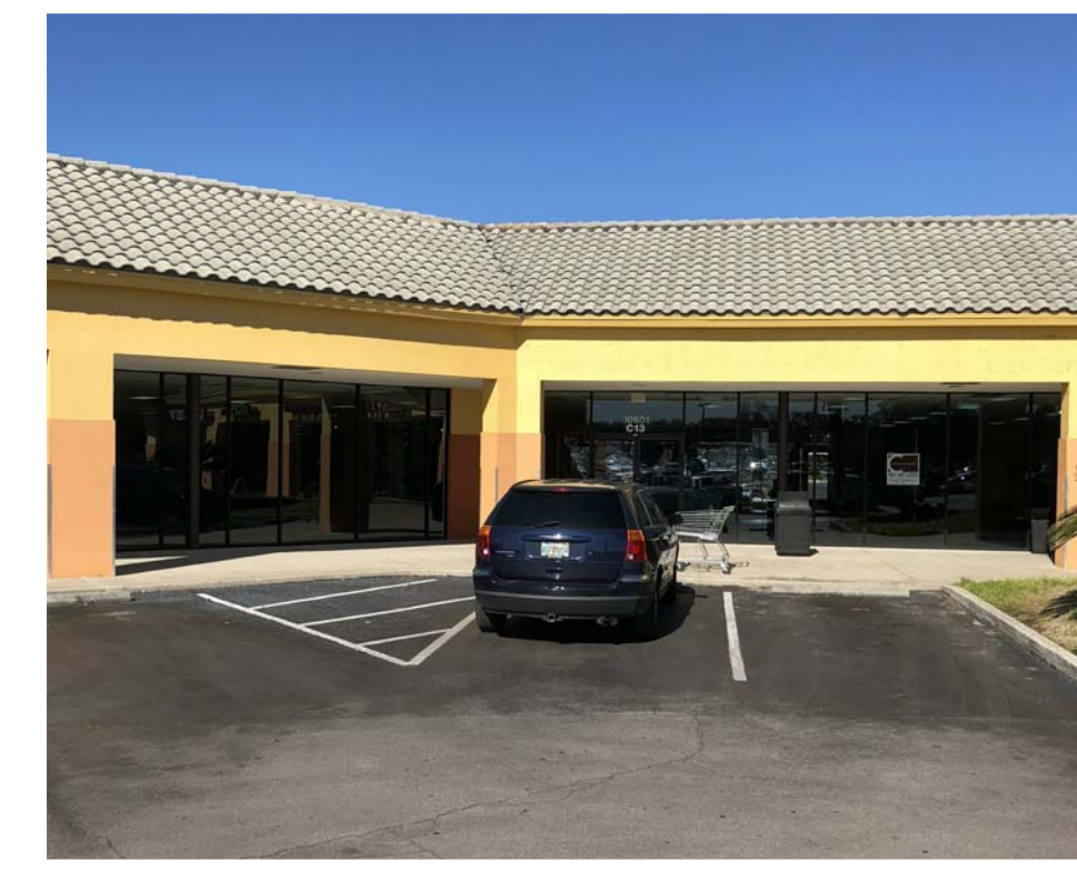
2 ELEVATION (PHOTO) NOT TO SCALE