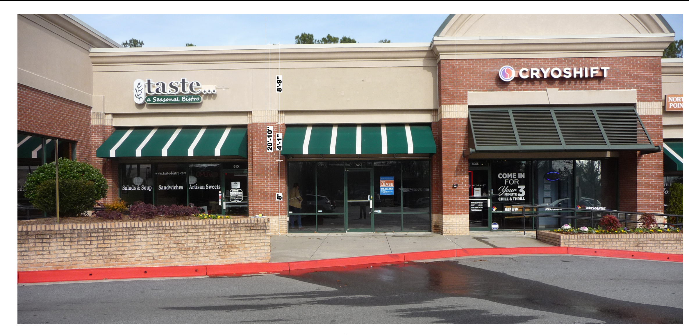
Front of Unit 620