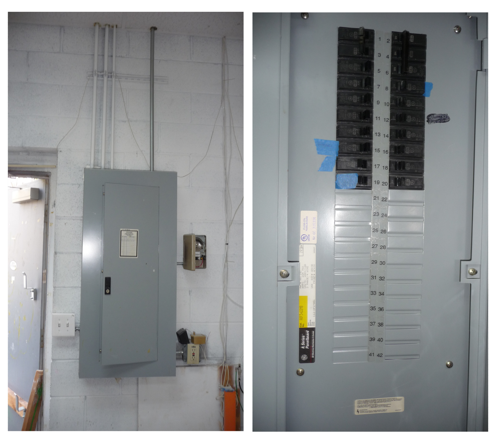
208/120 Volt Elec. Panel