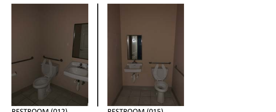
1 RESTROOM COMPLIANCE (PHOTOS) NOT TO SCALE