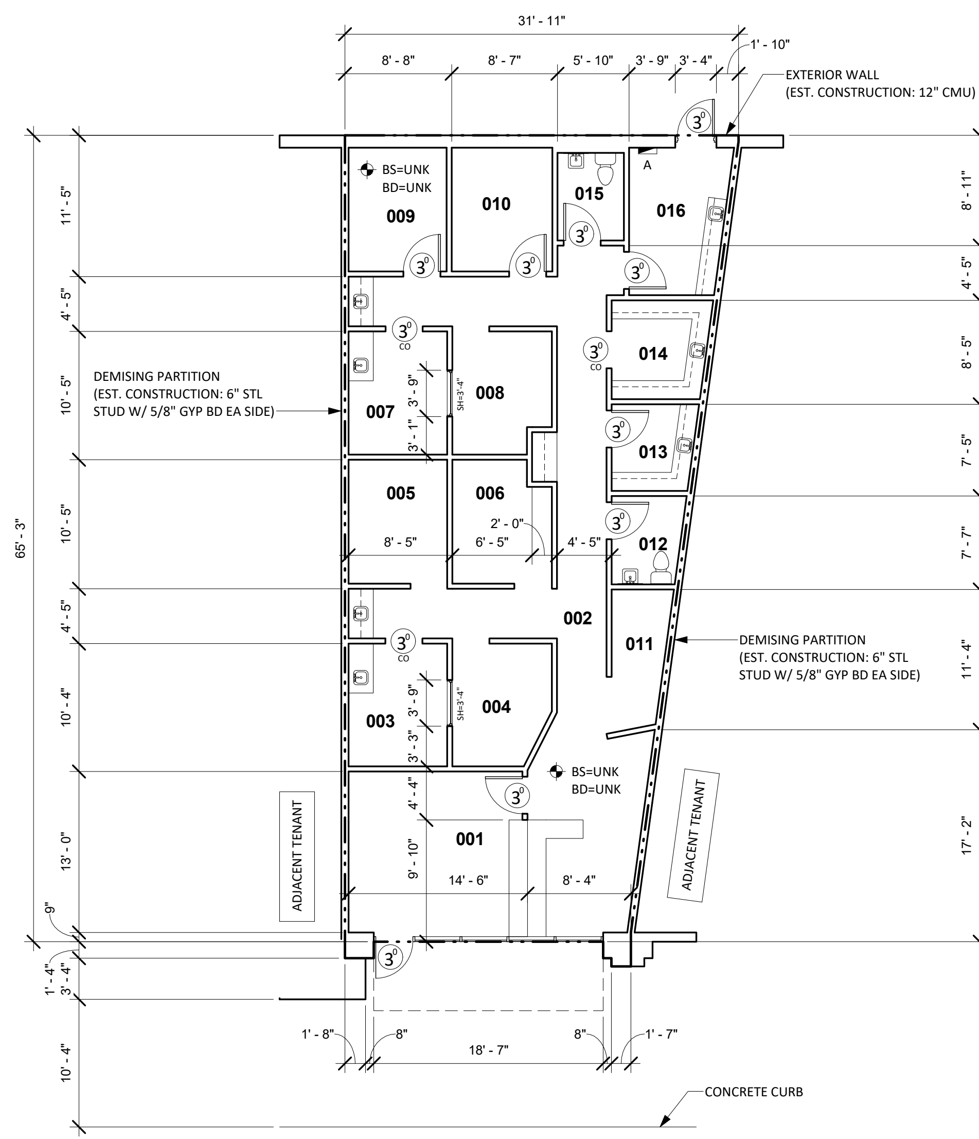
4 EXISTING FLOOR PLAN 1/8" = 1'-0"