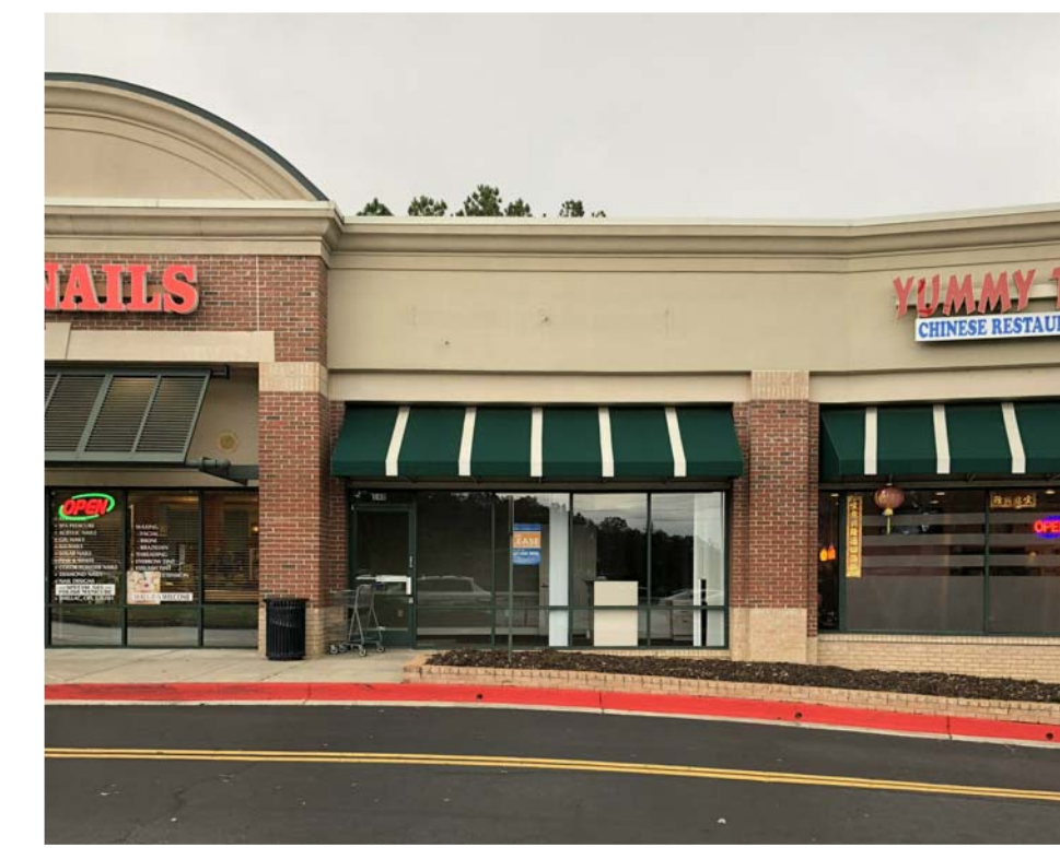
2 ELEVATION (PHOTO) NOT TO SCALE