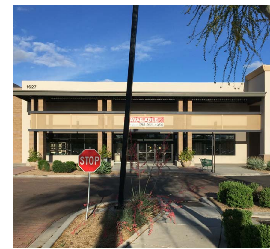
1 ELEVATION (PHOTO) 1/8" = 1'-0"