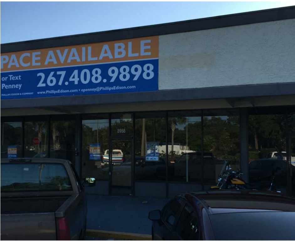
2 ELEVATION (PHOTO) NOT TO SCALE